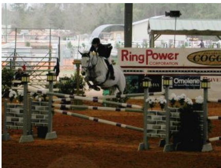
Sponsors are our Friends and we love them!

The North Florida Hunter-Jumper Association has outdone itself this year. For those of you who attended some of the recent wonderful events at the Clay County Fairgrounds, you know what we mean. All total there were 5 Grand Prix's with a total of $125,000 in prize money! There has been International level show jumping competition right here in Clay County for the last 5 weeks which culminated on Feb. 4 th . Our hats are off to the planners making this one of our largest events of the year with an economic impact to match. We won't know the numbers until next month.